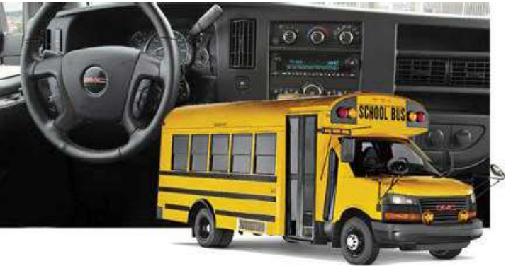
2023 GMC Savana Cutaway shown. Vehicle shown with upfits from an independent supplier and are not covered by the GM New Vehicle Limited Warranty. GM is not responsible for the safety and quality of independent supplier alterations.