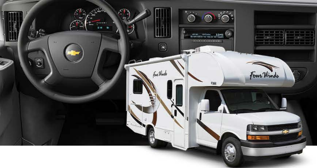
2023 Chevrolet Express Cutaway shown. Vehicle shown with upfits from an independent supplier and are not covered by the GM New Vehicle Limited Warranty. GM is not responsible for the safety and quality of independent supplier alterations.