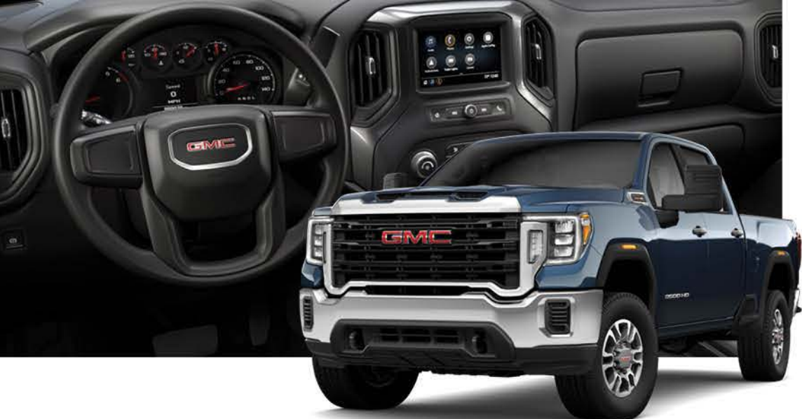
2023 GMC Sierra 3500 Heavy Duty Pro shown.