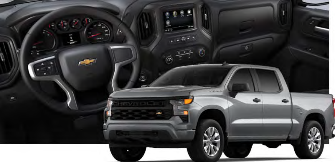
2023 Chevrolet Silverado 1500 Work Truck shown.