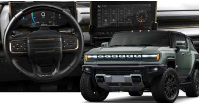
Preproduction 2024 GMC HUMMER EV SUV shown. Actual production model may vary.