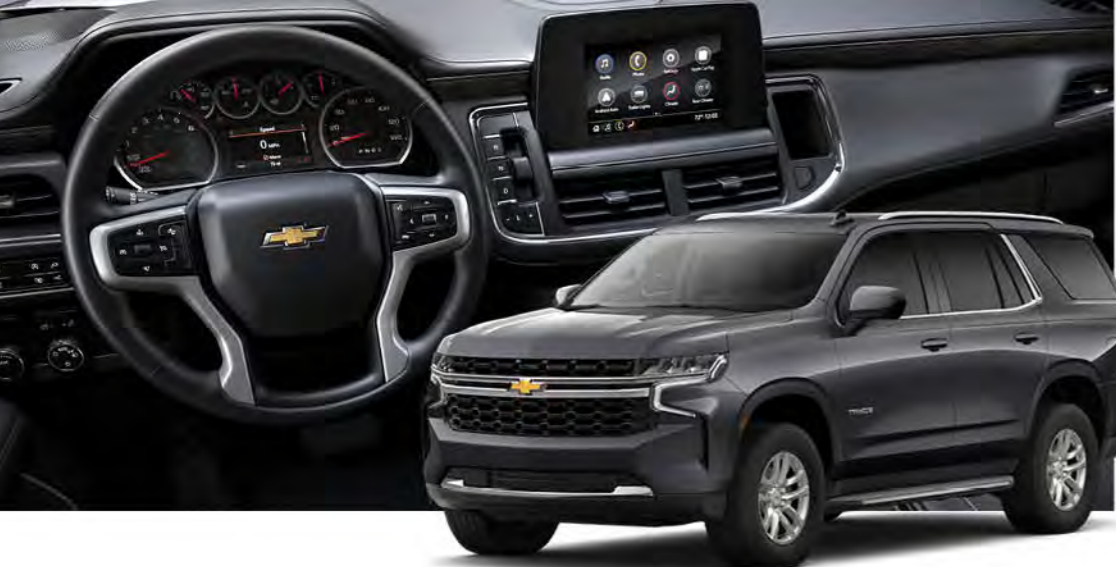
2023 Chevrolet Tahoe LS shown.