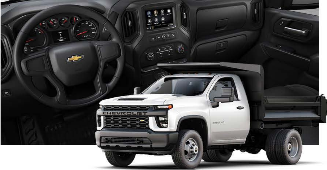
2020 Chevrolet Silverado 3500 HD Chassis Cab shown. Vehicle shown with upfits from an independent supplier and are not covered by the GM New Vehicle Limited Warranty. GM is not responsible for the safety and quality of independent supplier alterations.