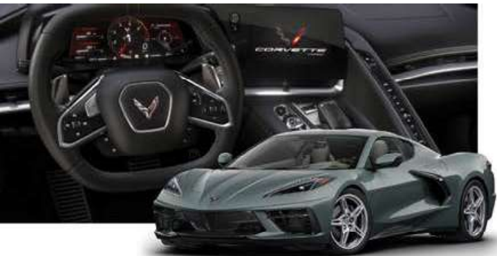
2024 Chevrolet Corvette Stingray 1LT Coupe shown.