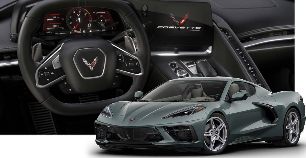
2024 Chevrolet Corvette Stingray 1LT Coupe shown.