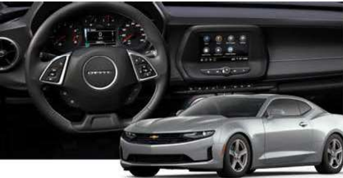
2024 Chevrolet Camaro 1LT Coupe shown.