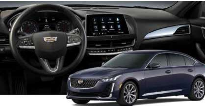
2024 Cadillac CT5 Luxury shown.