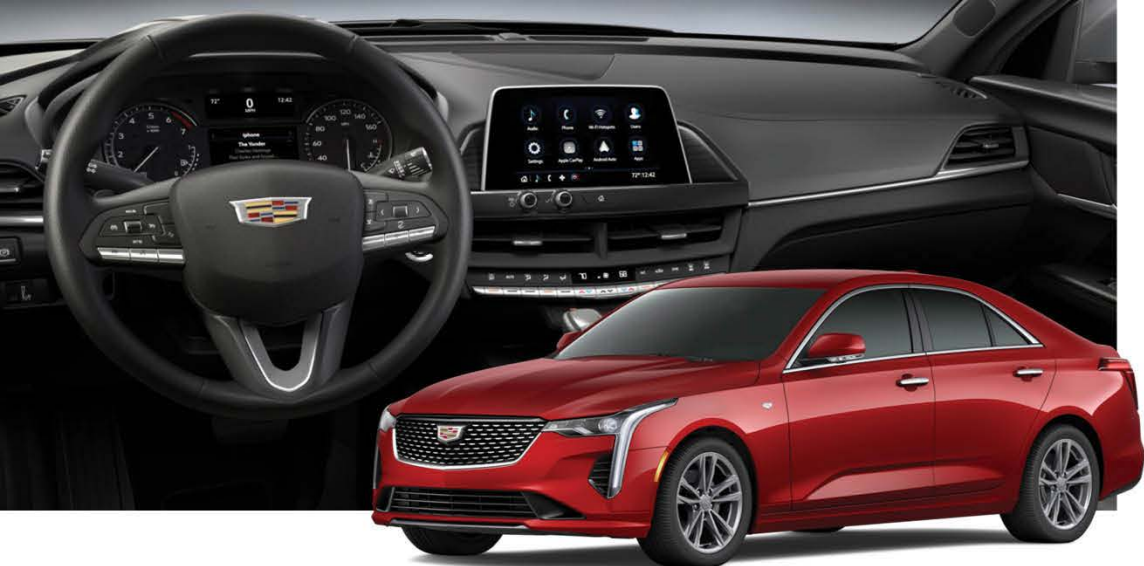
2024 Cadillac CT4 Luxury shown.