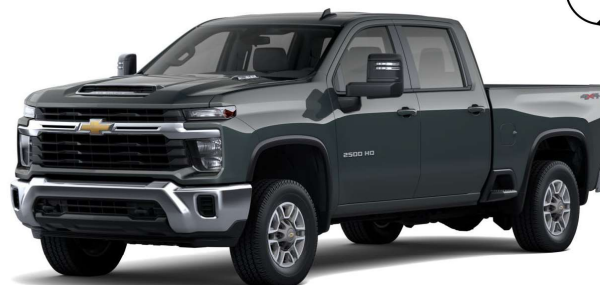
2026 Chevrolet Silverado 2500 HD LT shown.

NOTE: Exterior colors vary by trim level. See Order Guide for details.