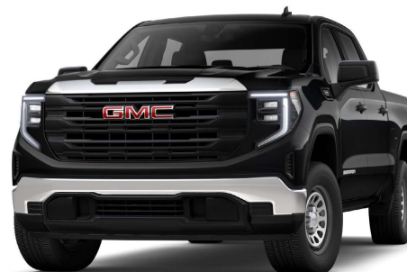
2026 GMC Sierra 1500 Pro shown.

NOTE: Exterior colors vary by trim level. See Order Guide for details.